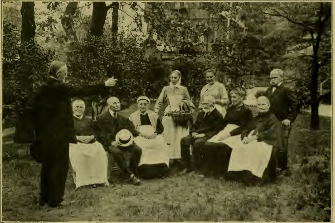
[ A Group from the Home for the Aged, Philadelphia—Entertaining His Friends